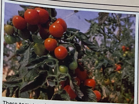
These tomatoes have been genetically altered to grow in conditions that would not support natural varieties of tomatoes.

Agriculture Biotechnology has many implications for agriculture. Disease-resistant crops could improve crop yields. To increase food production, crops could be engineered to grow in environments that would usually not be able to support such crops. The development of pest-resistant crops could reduce the need for chemical pesticides. The use of pest-resistant crops would allow for farming methods that are potentially better for the environment.