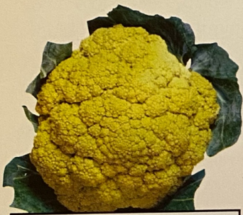
broccoli × cauliflower = broccoflower

Biotechnology is the use of living organisms in production and manufacturing processes. The term biotechnology can cover a range of activities. You could think of using yeast to make bread dough rise as a form of biotechnology. In a general sense, biotechnology includes any manipulation of a living matter intended to improve the human condition or the environment. For example, farmers have been altering plants and animals for thousands of years